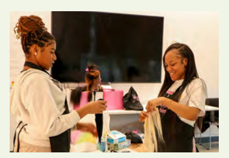
iKandi Academy Students - 2022 Grantee